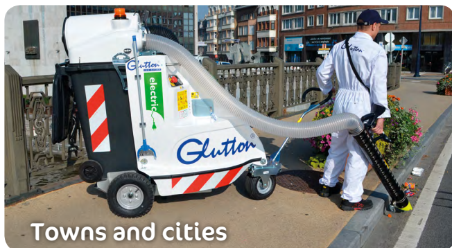
Towns and cities

Glutton® enhances the well-being and cleanliness of your town and boosts the status of the work done by your maintenance teams